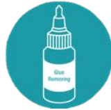
Glue-removing product (dissolvent)