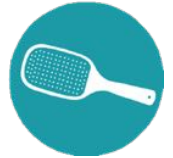
Brushes (tangle tamer, extension)