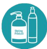
Hair styling products