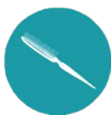
Selection of brushes