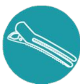
Double-pronged metal hair clip