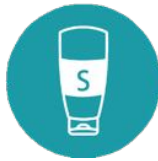
Shampoo (soapless base)